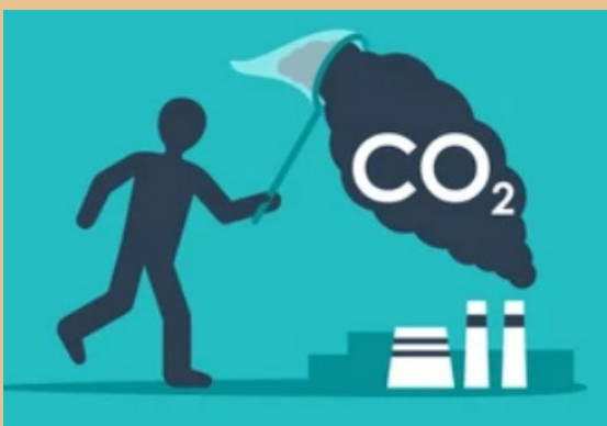
Biochar far exceeds the carbon sequestration rate for 50 trees which would need to grow for one year to capture one tonne of CO 2 (according to climateneutralgroup.com).

A Carbon removal markets benefit biochar producers by offering them a new revenue stream that can be used to help fund and scale projects. Producers are compensated per ton of CO 2 e stored. (Although dependent on multiple factors, one metric ton of biochar will typically store approximately 2.3-2.8 metric tons of carbon dioxide equivalent (CO 2 e)). Applying biochar to agricultural land also has numerous co-benefits beyond carbon storage including improved soil health and water retention.